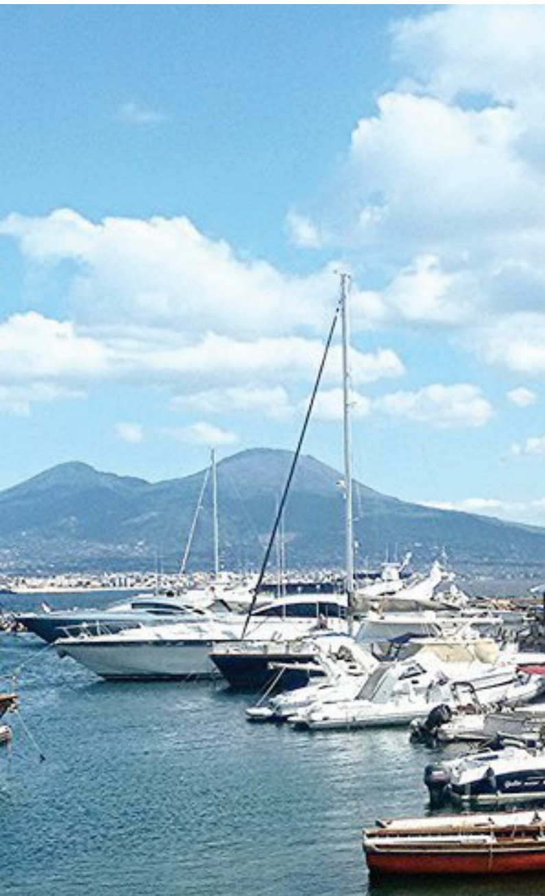
Napoli, Borgo Marinari