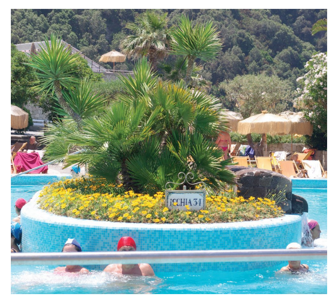
DAY 5: Ischia the green island at a glance

After breakfast meeting with the guide and transfer by minivan to Municipio square where now, after a recent archeological dig, you can admire the remains of the ancient roman harbour. Visit at Maschio Angioino a.k.a Castel nuovo, one of the most important bastioned castles of the city, still standing proud above the docks overlooking the gulf of Naples. Meal time 'alla napoletana- In the afternoon a short visit at the Royal Palace in the wide p.zza Plebscito. then let's cross the square and go for a nice stroll along via Toledo and its noble palaces and for an evening shopping. Back to hotel.