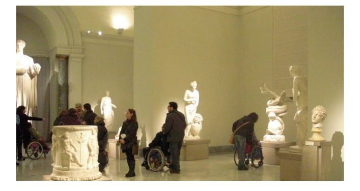
DAY 3: Ercolano – Gli scavi Archeologici Torre Annunziata – Villa di Poppea

Breakfast in hotel, meeting with guide and departure by C4Y minivan for a visit to Herculaneum. This town was covered by lava from the eruption of 79AD and for this reason its buildings are better preserved than those of Pompeii, often with the upper floors still intact, along with still-recognisable signs of everyday life, such as food, clothing, wood, mosaics and papyrus - a distinctive snapshot of the hustle and bustle of a once-popular holiday resort . The inhabitants remains were found in the caves along the marina, to which they had fled only to be drowned in mudslides. In short, the Ercolano site has an emotional impact that stays with you. Following this, a brief stop for lunch nearby. In the afternoon the tour continues to the Villa di Poppea, a magnificent residential construction from the middle of the 1st Century AD. Attributed to Poppea Sabina, Emperor Nero's second wife, but in any case the property of the royal family, it was under reconstruction when the eruption occurred..