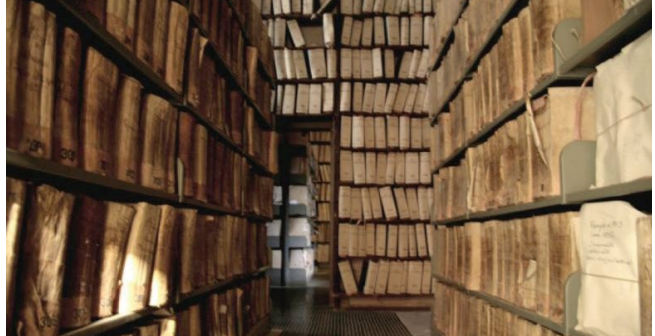
DAY 5: Avellino-Archivio di Stato

Breakfast in hotel, transfer by C4Y accessible minivan to Boscoreale, where we will visit the Antiquarium Nazionale: "Man and environment in the Vesuvian territory", situated in the confines of the Villa Regina archaeological zone. Numerous remains of every possible type are on display, often exceptionally well-preserved, having been covered by ash or lava up until their eventual unearthing during the excavations of Pompeii and surrounding villas in the 19th and 20th Centuries. Thanks to these remains, and to reconstructions of villas both in plastic and 3D, we can immerse ourselves in the daily life of a Vesuvian Farmhouse, in the time of the Romans, seeing with our own eyes and practically able to taste, the food they ate, the wine they drank, and how it was produced. Time for an enogastronomic lunch on the slopes of Vesuvius. In the afternoon we visit the site of Pompeii, an incredible testimony to Roman life, which gradually emerged in recent centuries from the darkness into which it had been plunged back in 79AD. Places worth a visit are numerous: The Faun's House; the Centurian's House; the Villa of Mysteries; the amphitheater; the Forum and so on. Time seems to stand still, with the material from the eruption having preserved entire, agonized, human outlines, houses, shops. All of this makes Pompeii a unique and unforgettable experience. Return to hotel in the late afternoon.